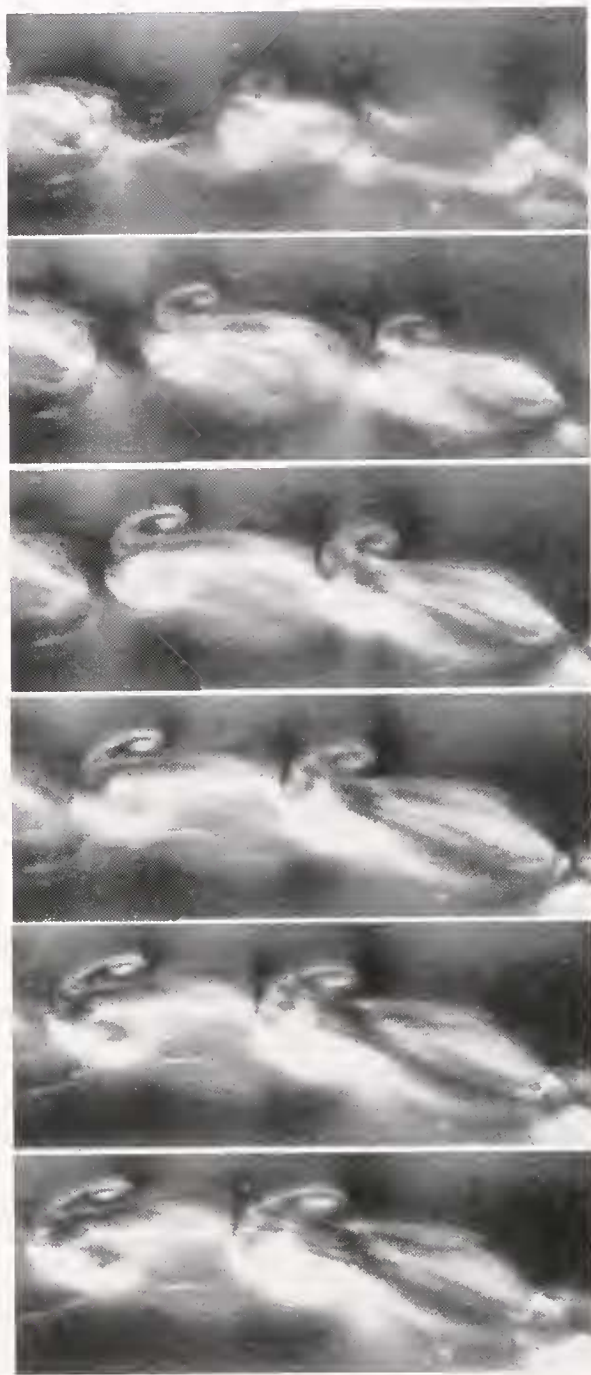
Figure 2. Dynamic analysis of figure 3A in Yen and Strickler (1996) showing the sequence of toroid structures separated by 67 ms. Note the lack of change in the location of the initiation point of the toroid, the advective movement of the head of the hydrodynamic feature, the vortices formed as the water moves, the growth of the toroid over 333 ms, and the fine-scale patchiness in color intensity (which can correspond to chemical concentration: for methods, see Strickler et al. , 1995). Scale bar = 4 mm.

The odorant distribution within the torus also is not the same as expected from diffusion. According to Okubo (1984), "an essential difference between the mechanisms of molecular and turbulent diffusion exists, where the flux of a property by molecular diffusion takes place always from the higher concentration to the lower concentration and is proportional to the concentration gradient. Turbulent flux, however, need not always be in the direction of down-gradient of the mean concentration nor can it always be described as diffusion." Close examination of the Schlieren image,